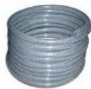
Braided Vacuum Tube